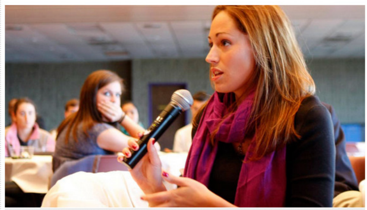
Red Watch Band trainees discuss their experiences at an Oct. 5 reception to recognize their efforts in helping to make the Northwestern community safer.

EVANSTON, III. --- Northwestern University students came together on the Evanston campus for an Oct. 5 reception to be recognized for their participation in a program that advocates thinking before drinking and helping peers avoid the tragic consequences of drinking too much.