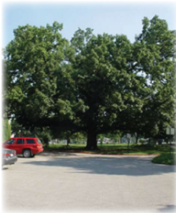
THE OLD MAIN BUR OAK