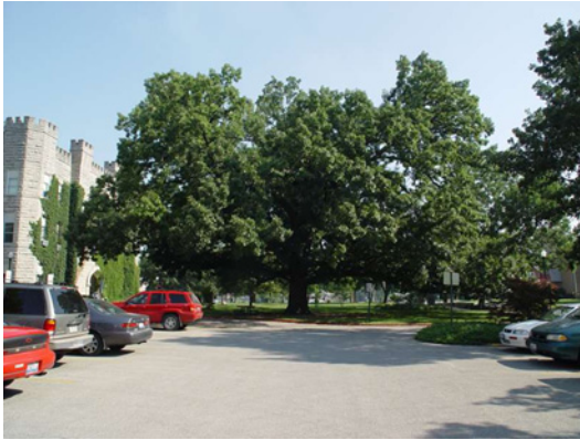
The Old Main Bur Oak in Happier Times

As you continue to read, you will find excellent news in the following entries that detail the great work being carried out by the faculty, staff and students of the Geology/Geography Department. Our faculty continue to excel in the areas of teaching, research and service and are paving the way to another excellent crop of EIU Geology/Geography alumni.